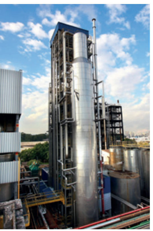
Semi-continuous deodorization system for vegetable oil, Brazil