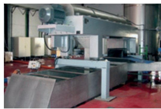
Decanter system for grape juice extraction, France