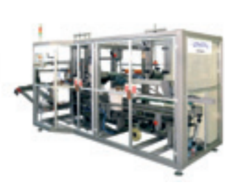
Cartoning module for bag-in-box