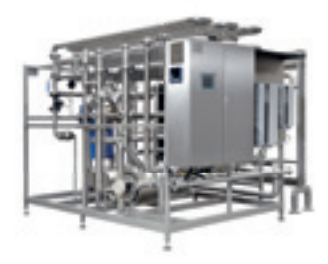
Pasteurizer/Aseptic sterilizer module