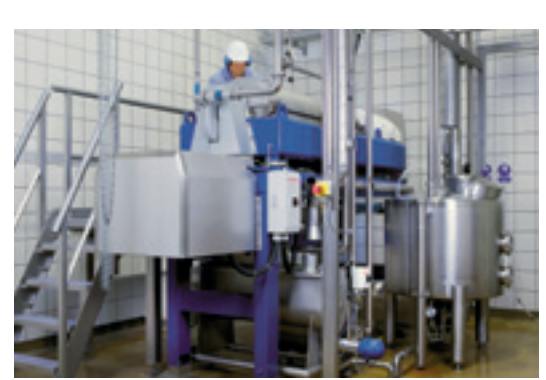
Decanter centrifuge system for protein processing