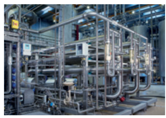
Ultra-filtration membrane system for blood proteins, Scandinavia