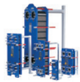
M-Series & TS-Series Gasketed plates