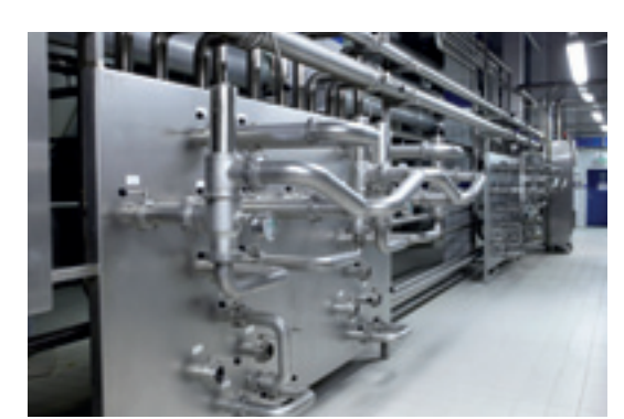
Complete green beer cellar, Russia