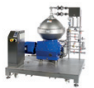
Separator module for beverages