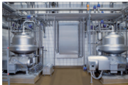
Disk stack centrifuge systems for protein processing, Scandinavia