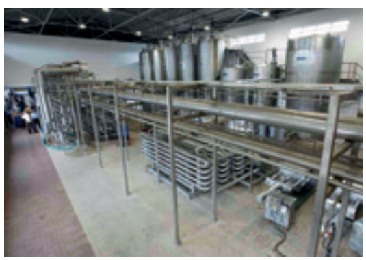
Complete mango processing plant, India