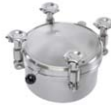
Pressure cover HLSD-2