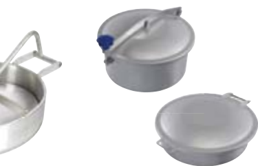
LKDC and LKDS