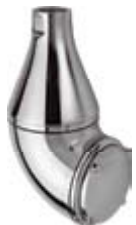
Toftejorg SaniJet 25