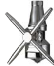
Iso-Mix rotary jet mixer