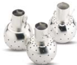
LKRK Static spray ball