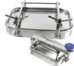
Access tank cover C-O-R